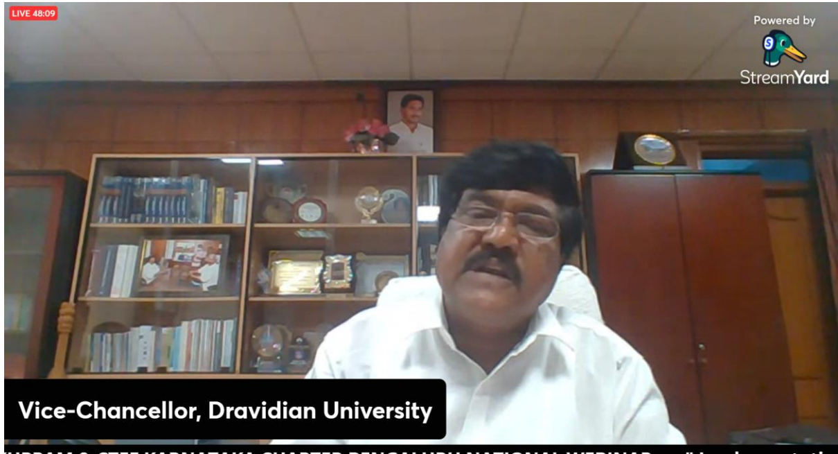
UPPAM & CTEF KARNATAKA CHAPTER BENGALURU NATIONAL WEBINAR on " Implementation